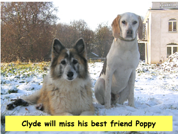
Clyde will miss his best friend Poppy